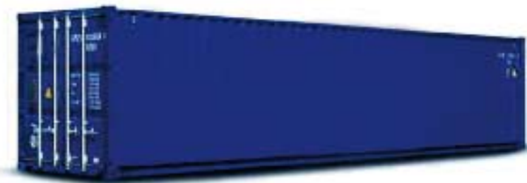
40' Standard Steel Container