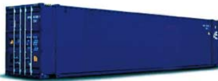
45' High Cube Steel Container