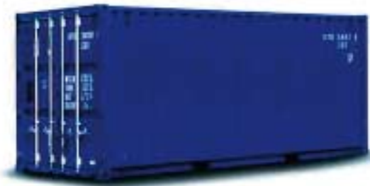
20' Standard Steel Container